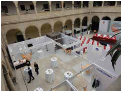
Event in the Patio de Cristal