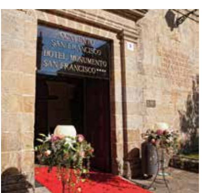
Decoration at the Main Entrance