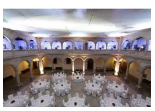
Patio de Cristal