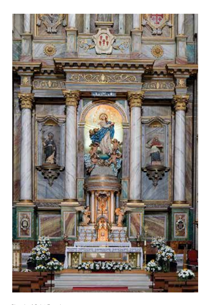
Church of Saint Francis