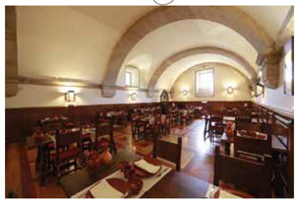
San Francisco restaurant