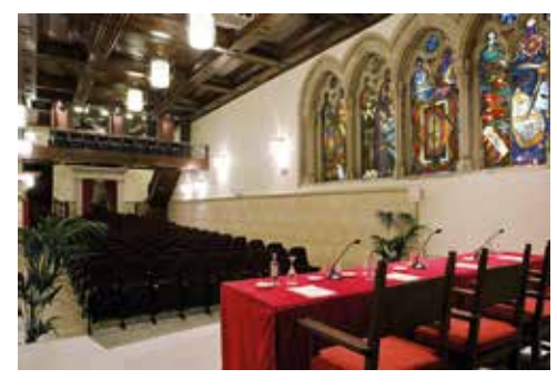
Carlos V Auditorium