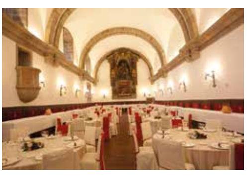
Banquet in the Monumental Dining Room