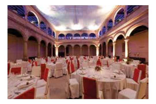
Banquet in the Patio de Cristal