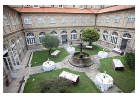
Appetizers in the Cloister of the Fountain