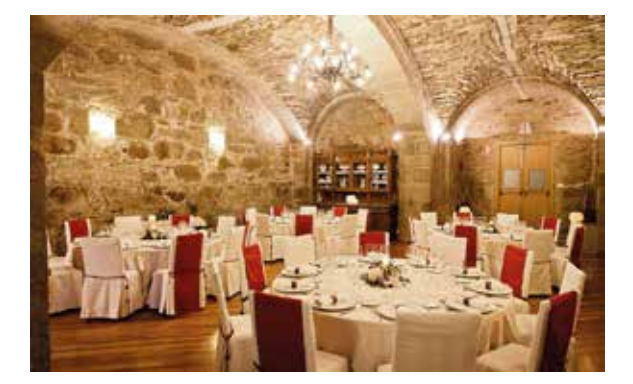
Wine cellar dining room