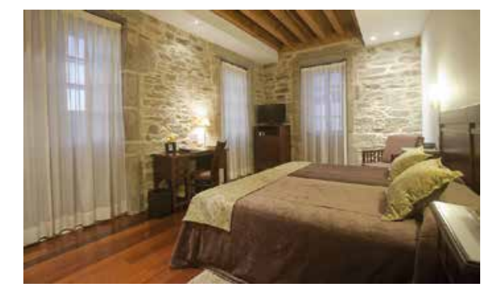
A room in the hotel