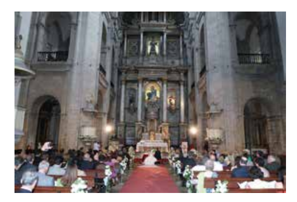
Interior of the Church of Saint Francis

Contact information: eventos@sanfranciscohm.com Tel.: 981 58 16 34