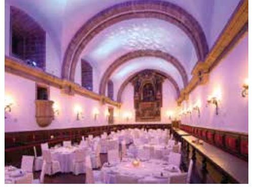
Monumental dining room