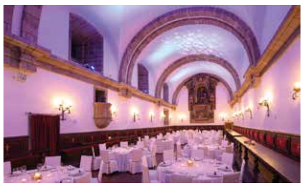
Monumental dining room

• Private dining rooms. The hotel offers private dining rooms. If you would like to reserve one of these dining rooms, please ask at the Reception desk. Subject to availability.