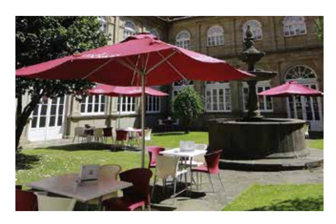
Terrace in the cloister of the fountain