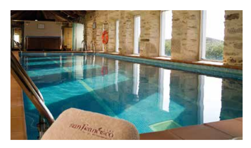
Indoor pool and Jacuzzi