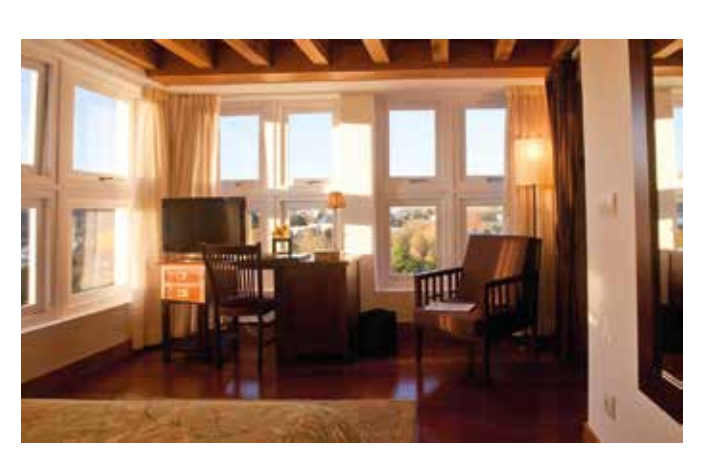
A room in the hotel