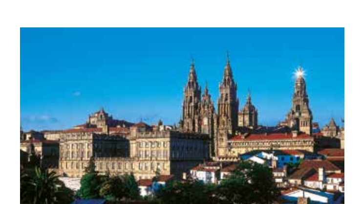
View of Santiago de Compostela