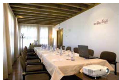
Galería I and II Rooms